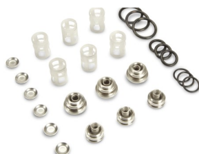
54001 Drain Valve Kit